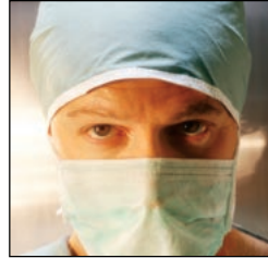
Flashpoint. Barbiturate OD's are often lethal because the drugs depress all areas of the brain—even breathing centers.

And that task becomes even more difficult when alcohol (or